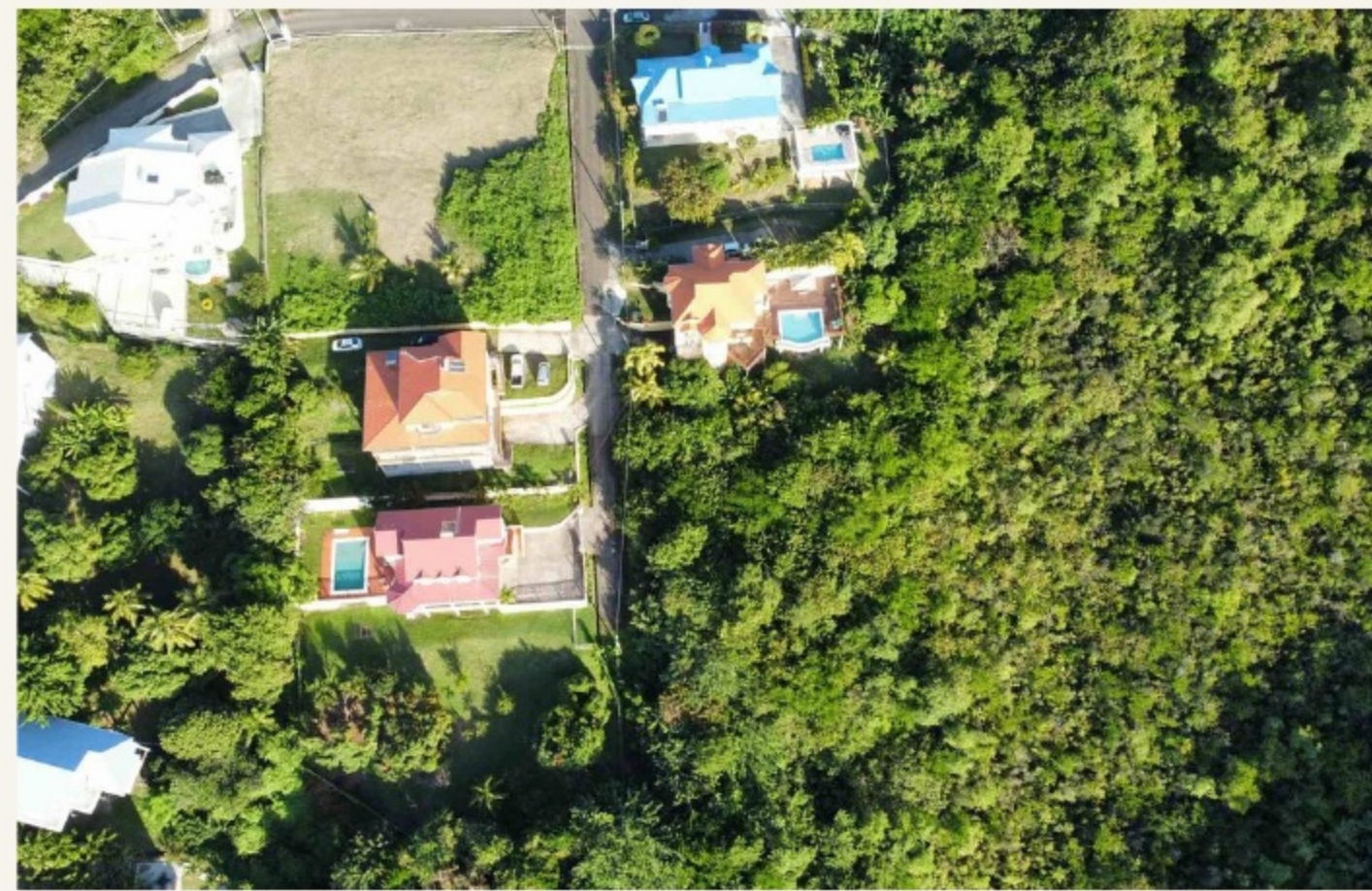
ROAD ACCESS · ESTABLISHED RESIDENCES