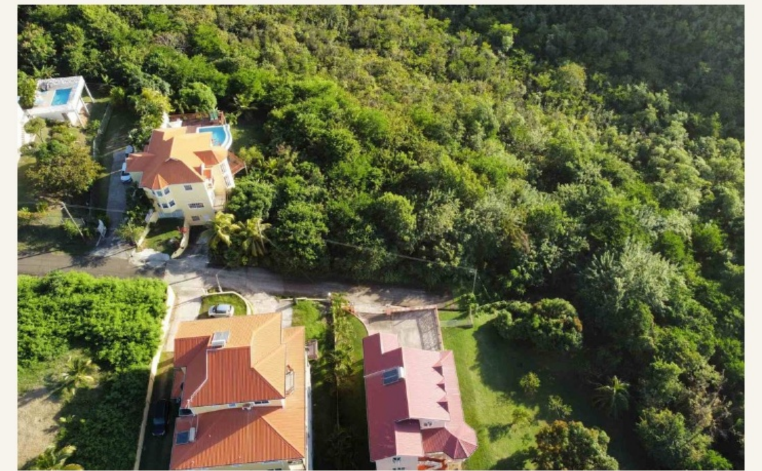
LUSH TROPICAL SETTING · LUXURY VILLAS