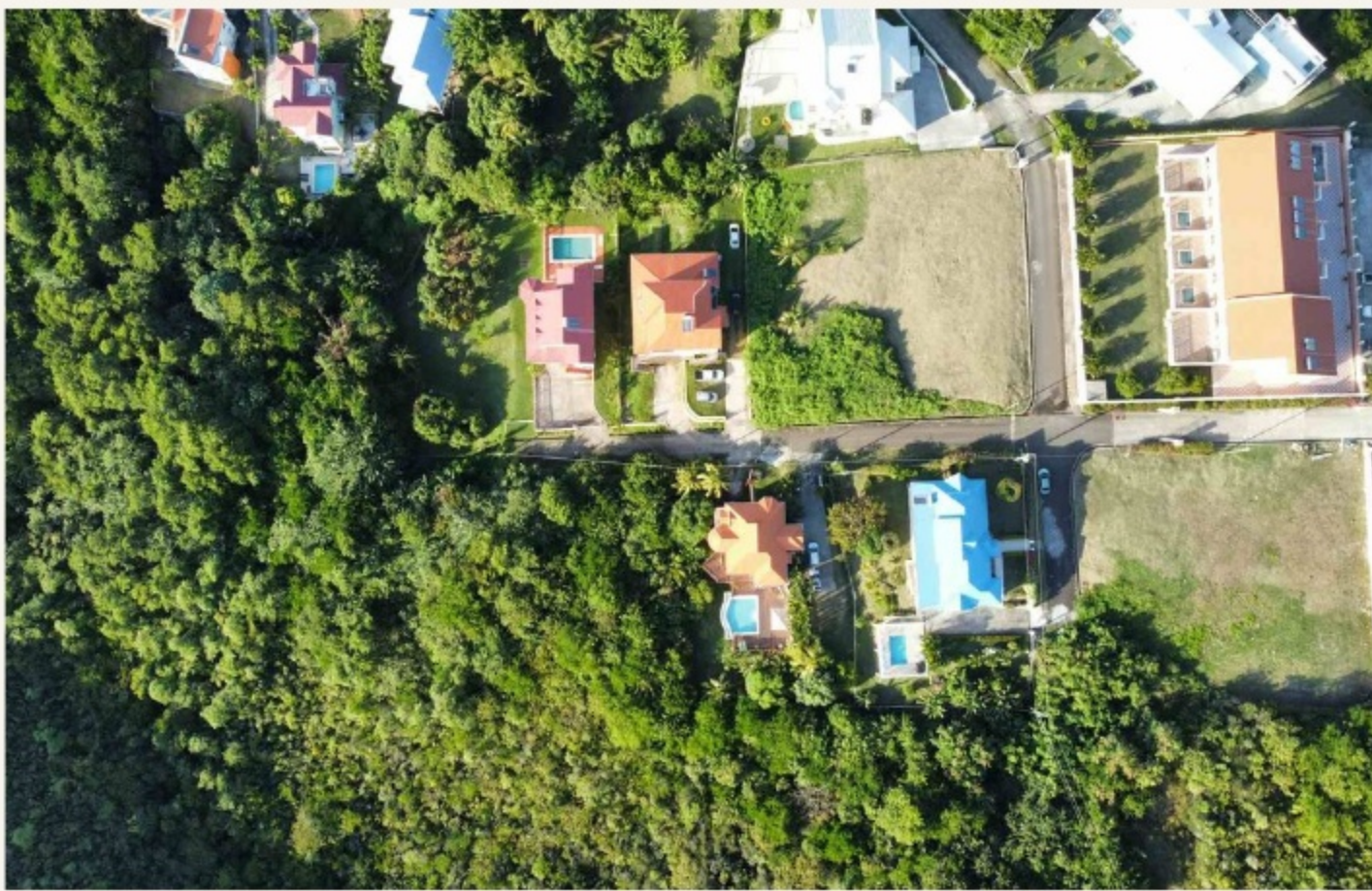
OVERHEAD VIEW · SURROUNDING VILLAS & POOLS